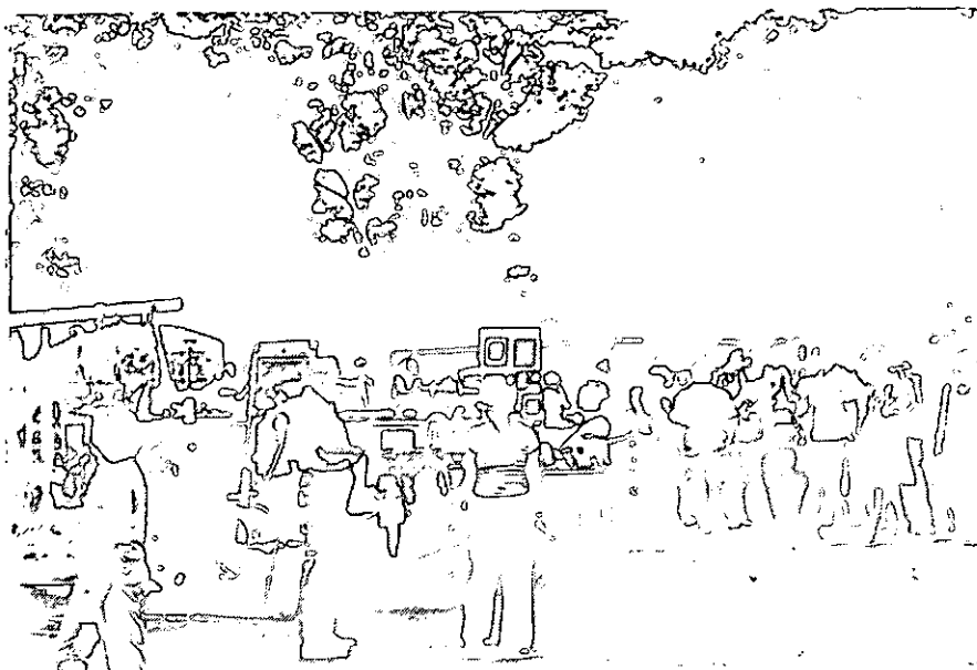
Festival of Arts - Bigger and better than ever.