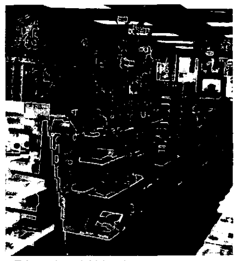
Educational Aids offers a wide variety of self-help for children.

In addition to the self-help for the majority of children, the store also stocks some Special Education materials and various creative items for the aifted child.