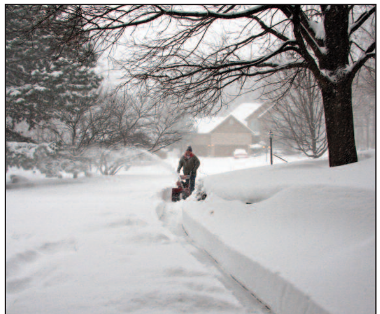
It was A LOT of snow!!!