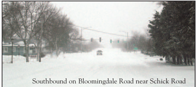
Southbound on Bloomingdale Road near Schick Road

The 2011 Blizzard began on February 1st and dropped over 20 inches of snow on Bloomingdale over a 24 hour period. The snowfall was accompanied by high winds and drifting, thunder snow, and low to zero visibility, followed by sub-zero arctic temperatures. On Feb. 2, Mayor Iden declared a State of Emergency in Bloomingdale. Here is some of the story in photos. Also, don't miss the "Blizzard Baby" story on p. 11.