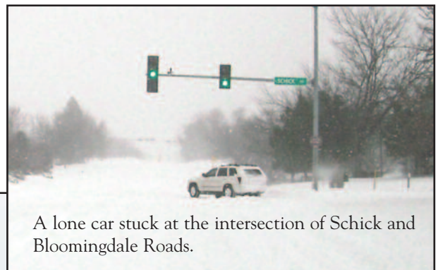
A lone car stuck at the intersection of Schick and Bloomingdale Roads.