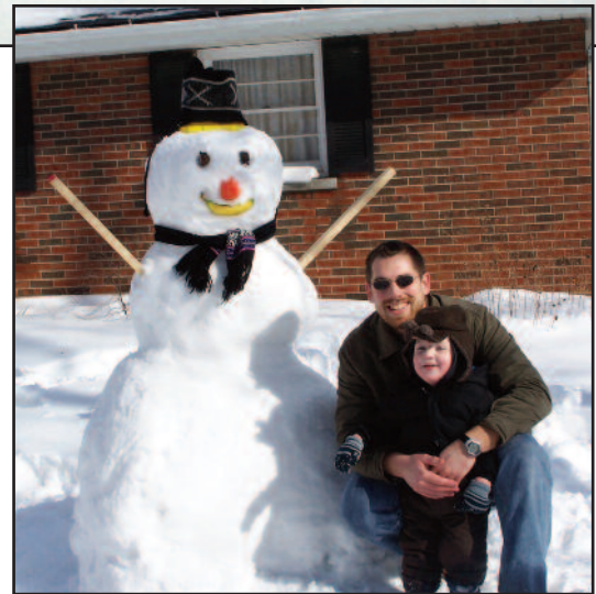
Making a snowman makes any amount of snow fun.