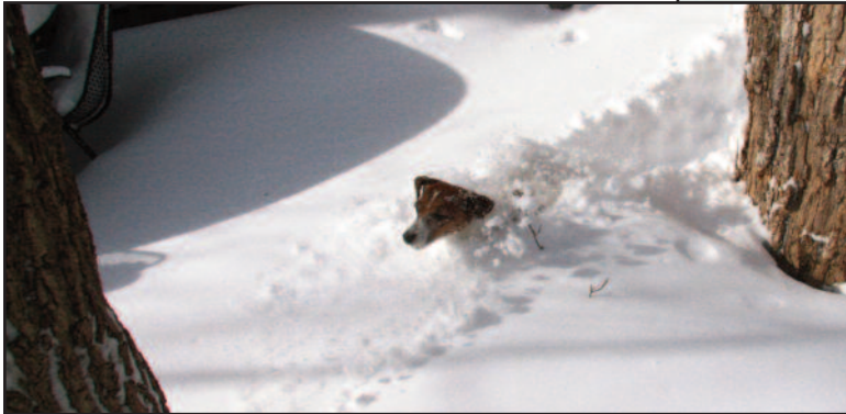
What a dog has to do to get to his tree!