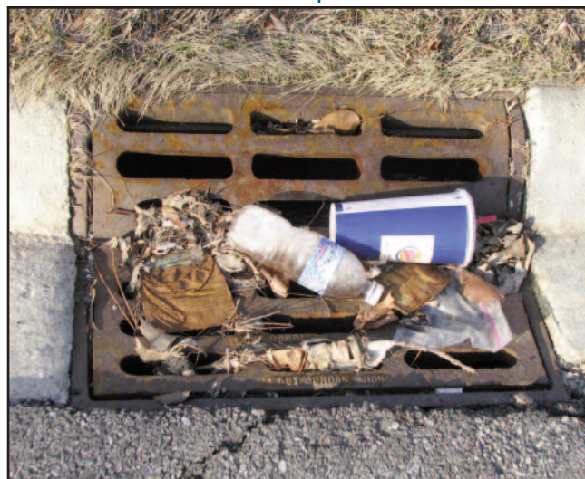
Storm inlet covered with debris

Keeping these stencils legible is an on-going project as the let-