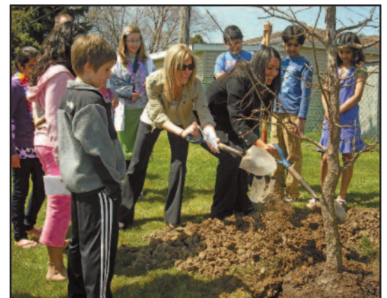
DuJardin students and teachers helped the Forestry Division plant a swamp white oak for Arbor Day.