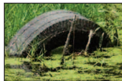
Mosquito breeding ground

This service is provided with a contract between Clarke Environmental Mosquito Management, Inc. and Bloomingdale Township, in conjunction with the Villages within the Township boundaries. Typically spraying begins in the spring and continues throughout the year until late fall, weather depending. Normal spraying is done at regular intervals depending on need. However, if residents are experiencing unusually high levels of infestation, there is a mosquito hotline (800-942-2555), which you can call, and Clarke will make arrangements for a special spraying.