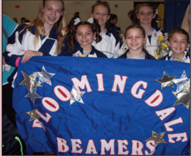
The Bronze Team State Champs hold the Beavers flag.

Congratulations are due to the Bloomingdale Park District Beavers for exceptional performances at the recent Illinois Park District Gymnastics Conference (I.P.D.G.C.) State Meets where 15 park districts were represented.