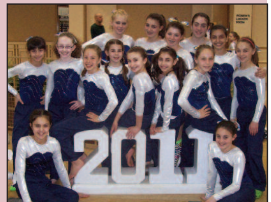
Both the Gold and Silver Teams earned the State Championship