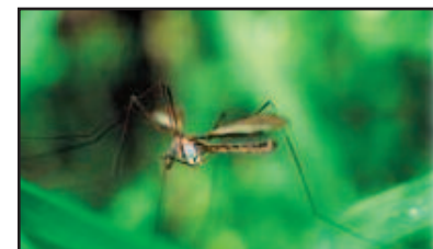
Mosquito: looking for a 'bite'!