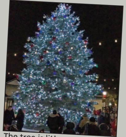
The tree is lit!