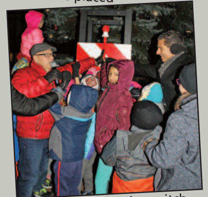
The kids help flip the switch