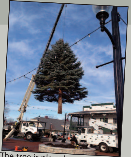
The tree is placed